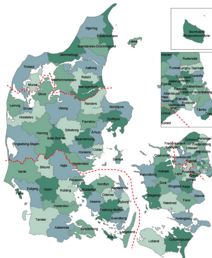
Figure 1. The new political map of Denmark

The recent reform brought along a radical restructuring of the political and administrative map of Denmark. The former 14 counties were dissolved and 5 new regions were created. At the same time, 271 municipalities were merged into 98 new ones. These changes have had important implications on the management and planning of regional development matters. With the increased central government's focus on strengthening Denmark's role in the global economy, a new role for planning at the regional level was introduced. The regions are now part of a 'partnership strategy' aimed at supporting the central government's globalisation approach. The strong and technical land-use regulatory regime was dissolved and moved almost entirely away from the regional level. Most land-use responsibilities and competencies are now in hands of the municipalities and the central government. Through municipal plans, the municipalities should now undertake the task of linking national planning and the provisions of local plans on the use and development of each district and between national planning and the specific administration of rural zones (Ministry of the Environment 2007:18).